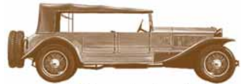
1926 Lancia Lambda