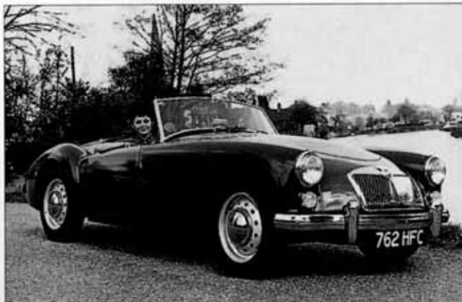
1961 shot of the MGA 1600 Mk II with 1622cc engine

Front suspension was by wishbones with coil springs,