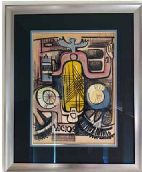
The re-framed original artwork that inspired the Backfire covers